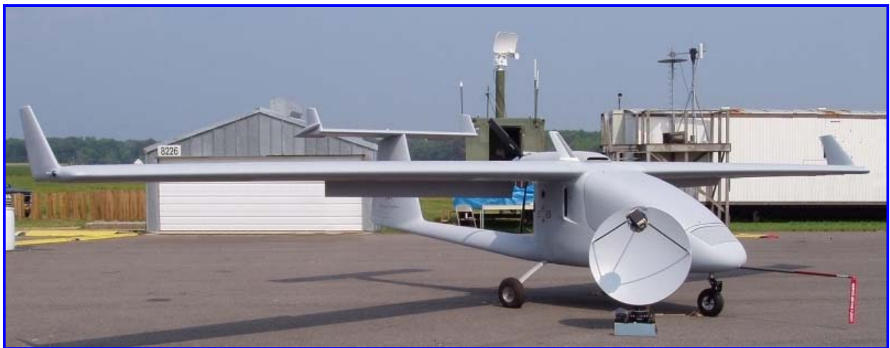
Echo Hawk UAV

The Echo Hawk UAV C 2 suite is comprised of flight proven COTS components for flight navigation, guidance, and control. The UAV can be operated as a remotely piloted platform via redundant line-of-sight radio modems or as a semi-autonomous platform via embedded waypoint navigation and guidance logic.